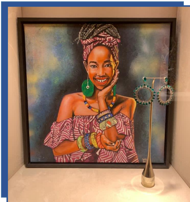
One of his latest art works: (exhibited in the BVLGARI boutique in Zurich in November 2020)